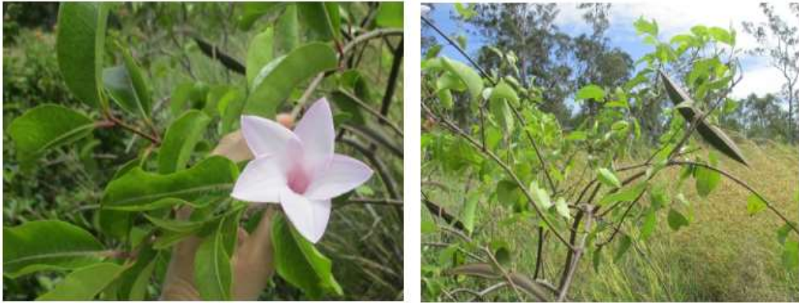
Image: Rubber vine