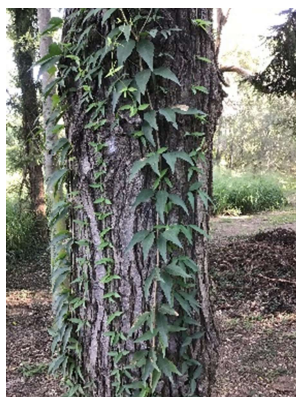
Image: Cats Claw Creeper