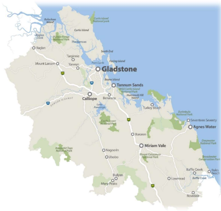
Figure 1 Geographical Map of GRC Area

We are proud to showcase our pristine and natural environments; it is essential that the region's coastal environments are maintained and managed by controlling existing and potential infestations of invasive species