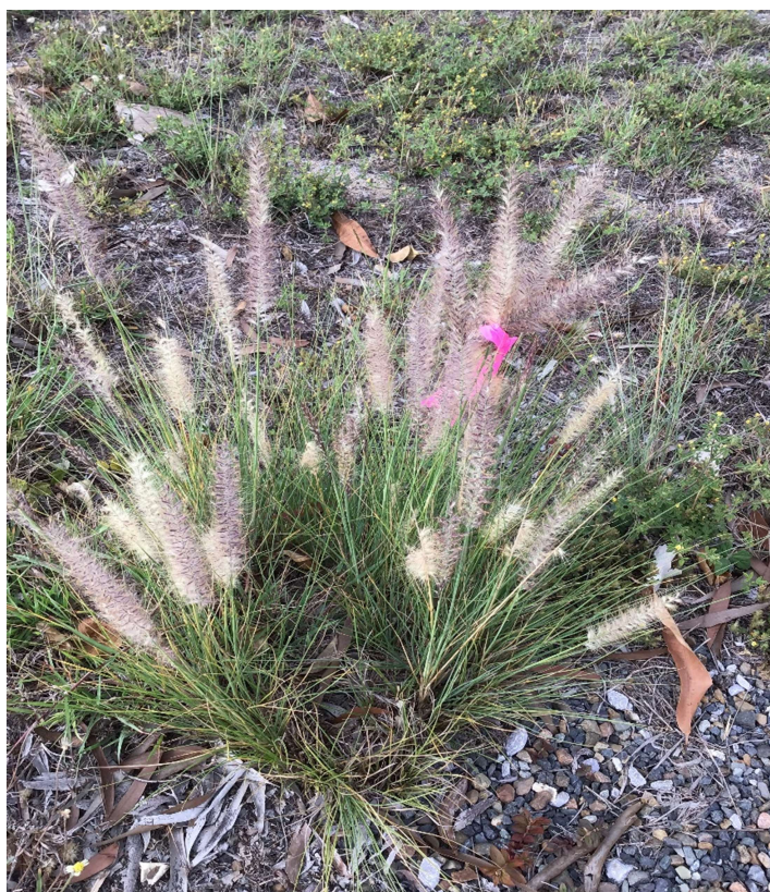
Image: African Fountain Grass