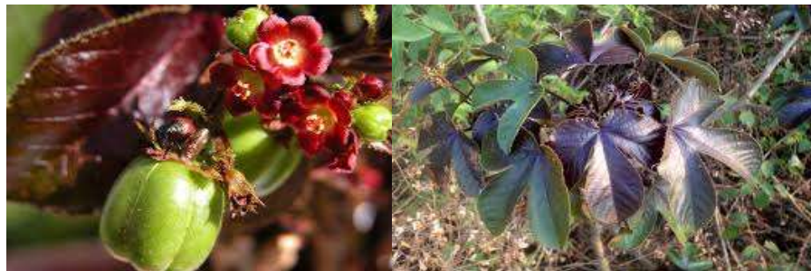
Image: Bellyache bush