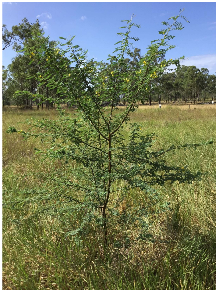
Image : Prickly Acacia