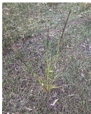
Image: Giant Rats Tail Grass